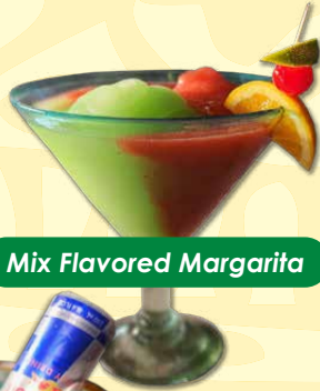
Mix Flavored Margarita

House Margarita mix with a bottle of Corona beer (or your favorite beer) and tequila.