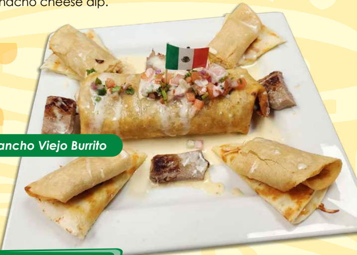
Rancho Viejo Burrito

Rancho Viejo Burrito.....$11.00 Deep fried burrito with ground beef, chicken, rice, and beans inside. Topped with nacho cheese dip.