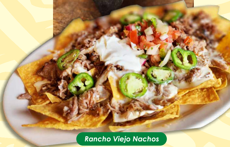
Rancho Viejo Nachos