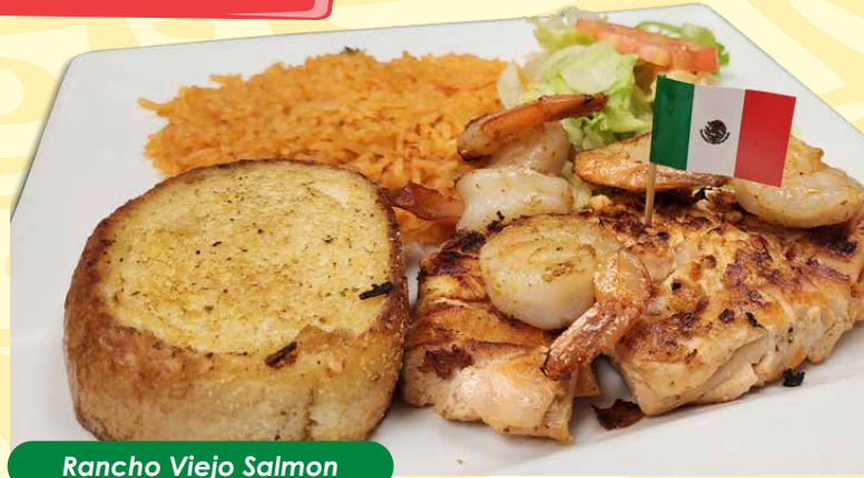
Rancho Viejo Salmon